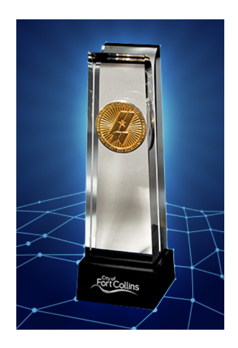
Malcolm Baldrige National Quality Award Recipient 2017